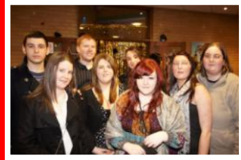
Big Deal Grants Scheme