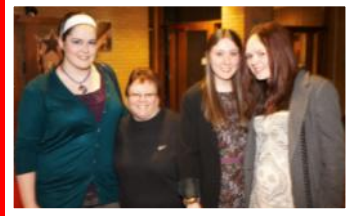
3rd Huyton Guide Leaders