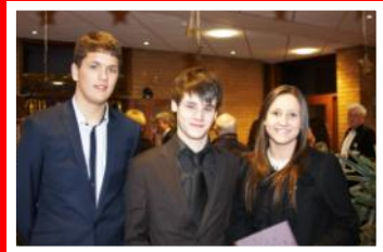
Huyton Sea Cadets