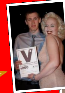
M.A.D. Youth Group