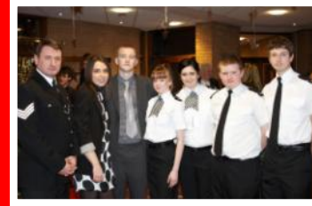
Knowsley Police Cadets