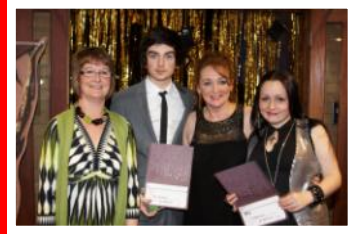
Huntington's Disease Association