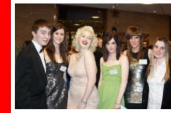
Knowsley Youth Action Team